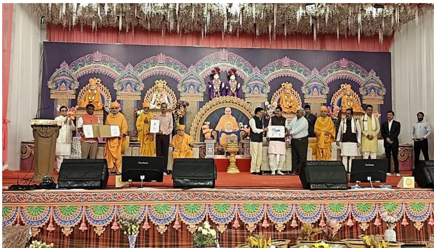
Exchange of MOU with IPDC in Presence of Hon'ble Chief Minister of Madhya Pradesh