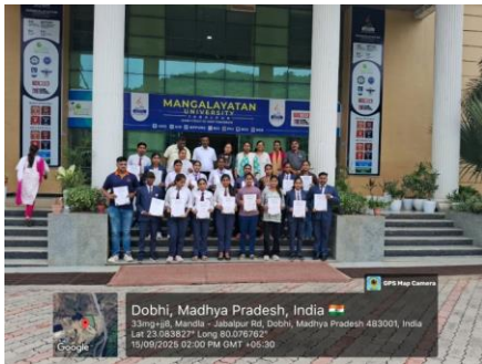
Engineer's Day Celebration - 15/09/2025