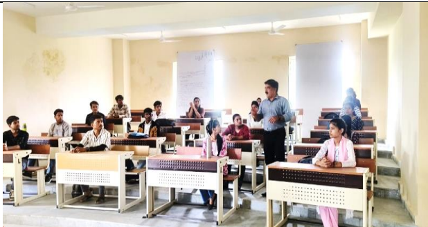
AD MAD SHOW- 21/08/2025