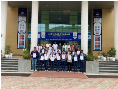
Training Session on “Canva Design and Digital Content Creation” - 26/09/2025

The Training session, successfully enhancing digital literacy. Students gained practical expertise in designing various materials, including visiting cards, flyers, brochures, social media content, and presentations, effectively boosting visual communication skills.